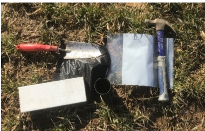
Sampling materials: trowel, metal pipe, wood block, and plastic bag