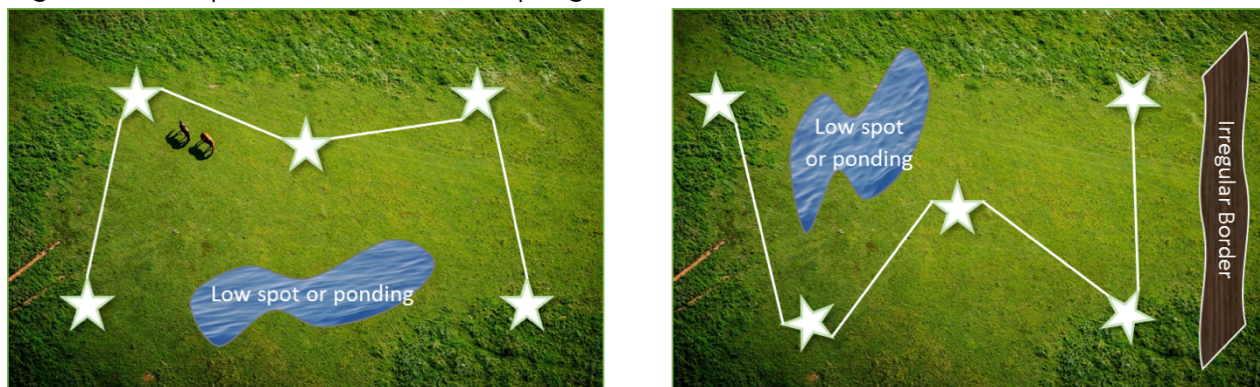
Figure A. Examples: General field sampling