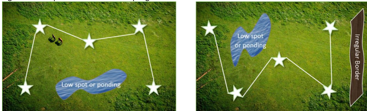
Figure A. Examples: General field sampling