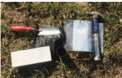
Sampling materials: trowel, metal pipe, wood block, and plastic bag